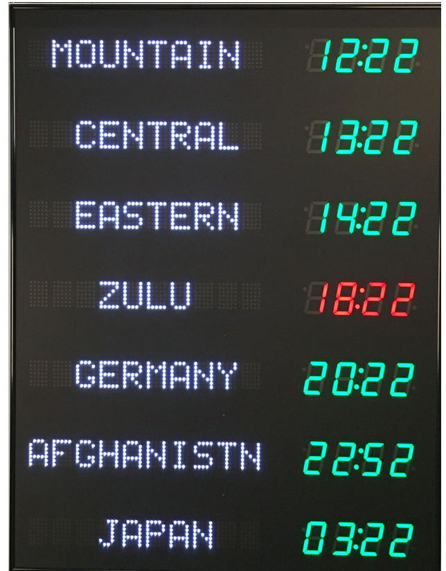
Model 34200 - 2.5" time, 2.0" zone labels, 7 zones